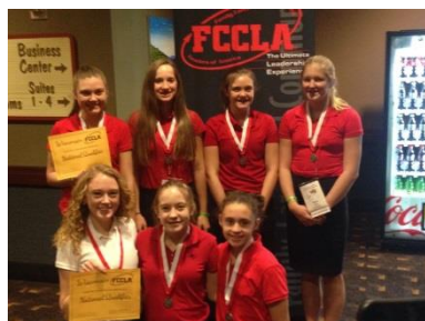
Menomonie State Qualifiers 2016/17 in WI Dells

STAR Events (Students Taking Action with Recognition) are competitive events in which members are recognized for proficiency and achievement in chapter and individual projects, leadership skills, and career preparation. Example project categories include: Focus on children, Sports Nutrition, Career exploration, and many others that fall within the FACS umbrella. If you're interested in participating in a project think of where your passion lies and we'll find a project for you!