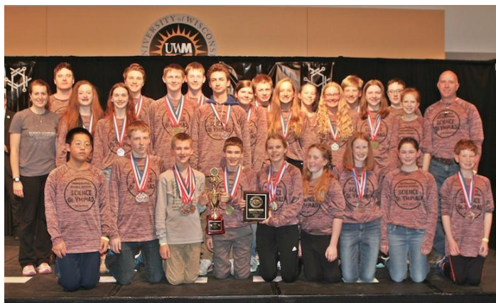
Menomonie Middle School Science State Olympiad Team 2017